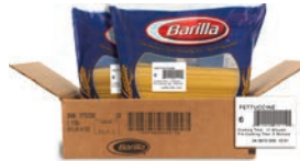
354006 Fettuccini Long Cuts 10# 2/CS $1.00