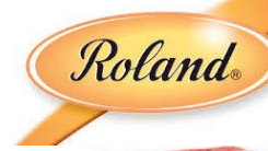
P7158 Chicken Tenders Breaded Rotisserie 10# 1/CS $1.50