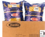
440081 Rotini 10# 2/CS $1.00