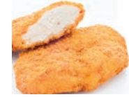
P7509 Chicken Breast 4oz Breaded 10# 1/CS $2.00