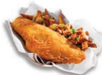
23828 Fish: Pollack Big-Bob-Belly-Buster 10# 1/CS $2.00