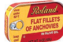
AN2413 Anchovies w/ Olive Oil 14oz 12/CS $5.00