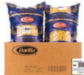
440083 Rigatoni 10# 2/CS $1.00