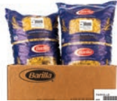
440065 Farfalle 10# 2/CS $1.00