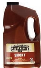
B05309 Cattlemen's Smoky BBQ Sauce 1Gal 4/CS $2.00