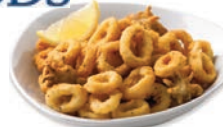
CR62 Calamari Rings Italian 6/CS $2.00