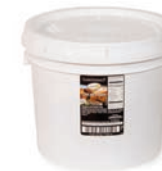
CMB30 Classic Gourmet Chicken Flavored Base 25# 1/CS $2.00