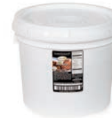
BB25 Classic Gourmet Beef Flavored Base 25# 1/CS $2.00