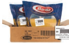
001401 Spaghetti 10# 2/CS $1.00